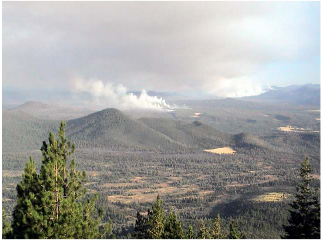
Goose Fire looming over Lake Britton (8/5/09)